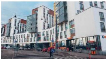
One millionth ARA housing: HOAS, Helsinki

➤ In euros the difference is on average 325 € per month