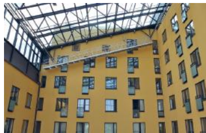
The first certified passive energy apartment building in Finland: Assisted living centre Onnelanpolku in Lahti